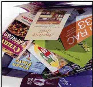
✓ Junk Mail