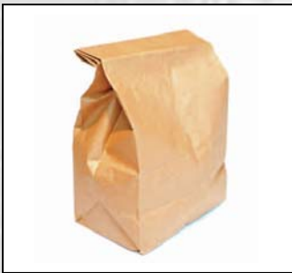
✓ Non-soiled Bags