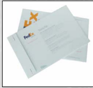
✓ Soft Cardboard