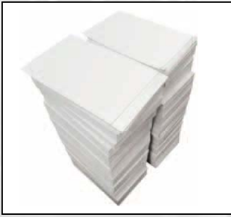
✓ Office Paper