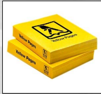
✓ Phone Books