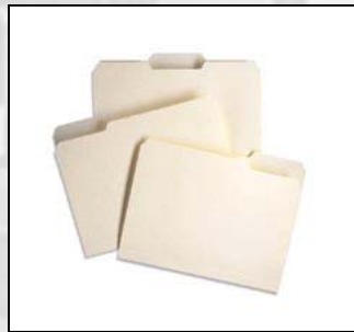
✓ File Folders