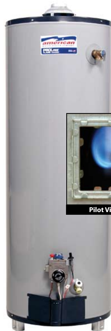
Pilot View Port

*For complete warranty information consult the written warranty of American® Water Heater Company at (800) 999-9515.